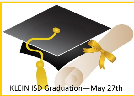
KLEIN ISD Graduation—May 27th